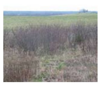
Chickasaw plum planting